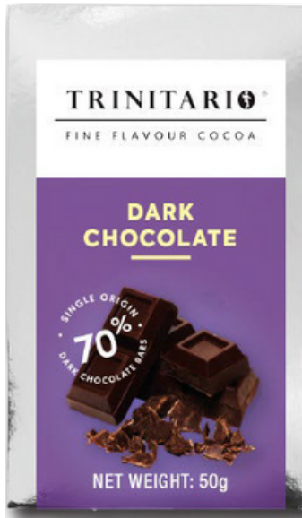
70% DARK CHOCOLATE BAR (50G)

WHOLESALE PRICE: $40.00 TTD RETAIL PRICE: $48.00 TTD