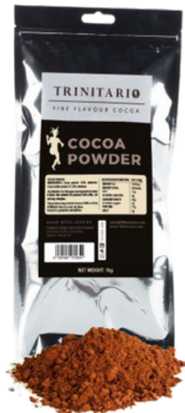
COCOA POWDER (25KG)