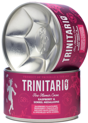
RASPBERRY & SORREL MEDALLIONS (100G)