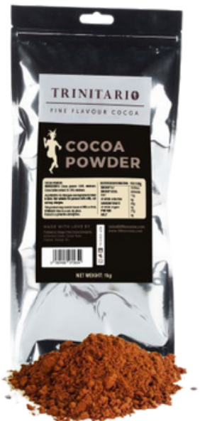
COCOA POWDER (10KG)

WHOLESALE PRICE: $195.00 TTD RETAIL PRICE: $225.00 TTD