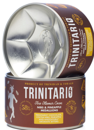
NIBS AND PINEAPPLE MEDALLIONS (88G)