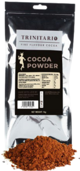
COCOA POWDER (200G)

WHOLESALE PRICE: $55.00 TTD RETAIL PRICE: $70.00 TTD