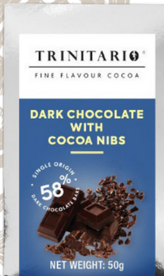
58% DARK CHOCOLATE WITH COCOA NIBS BAR (50G)

WHOLESALE PRICE: $40.00 TTD RETAIL PRICE: $48.00 TTD