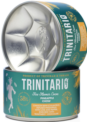
PINEAPPLE CHOW (80G)