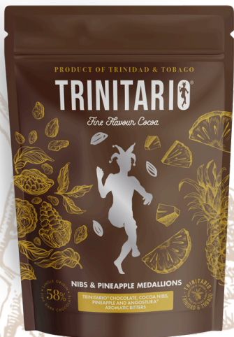
NIBS & PINEAPPLE MEDALLIONS (50G)