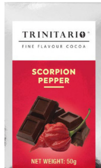
SCORPION PEPPER BAR (50G)

WHOLESALE PRICE: $40.00 TTD RETAIL PRICE: $48.00 TTD