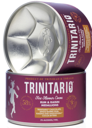
RUM AND RAISIN MEDALLIONS (88G)