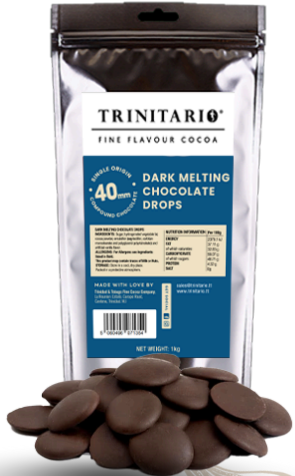
DARK MELTING CHOCOLATE DROPS (1KG)

WHOLESALE PRICE: $125.00 TTD RETAIL PRICE: $150.00 TTD