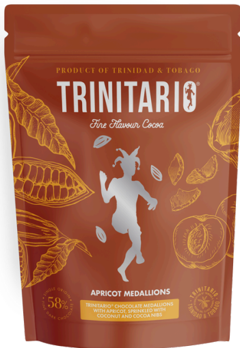
APRICOT MEDALLIONS (50G)

Loved our steelpans but don't necessarily need another? Our sharing packs are available for you to still get the Trinitario chocolates you love.