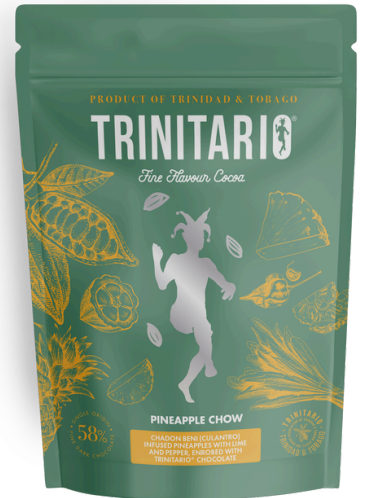
PINEAPPLE CHOW (50G)