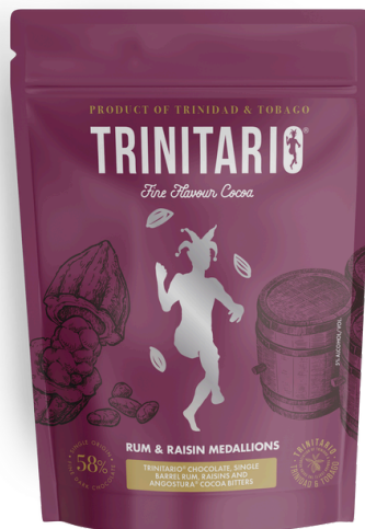
RUM & RAISIN MEDALLIONS (50G)