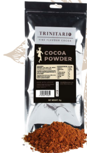
COCOA POWDER (1KG)

WHOLESALE PRICE: $55.00 TTD RETAIL PRICE: $70.00 TTD