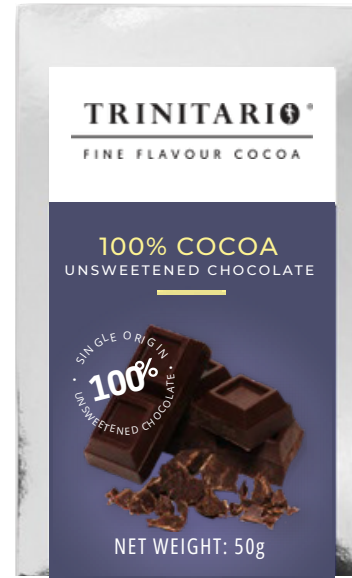
100% DARK CHOCOLATE BAR (50G)

WHOLESALE PRICE: $40.00 TTD RETAIL PRICE: $48.00 TTD