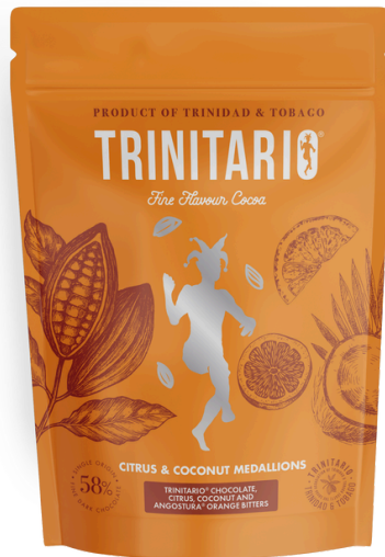
CITRUS & COCONUT MEDALLIONS (50G)