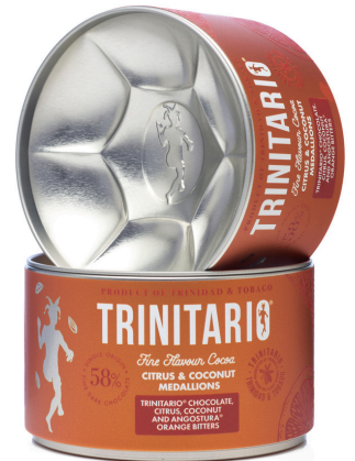
CITRUS AND COCONUT MEDALLIONS (88G)