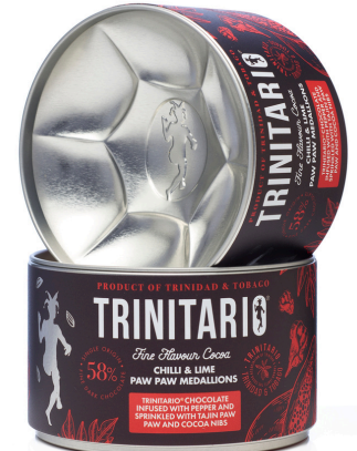
CHILLI & LIME PAW PAW MEDALLIONS (88G)