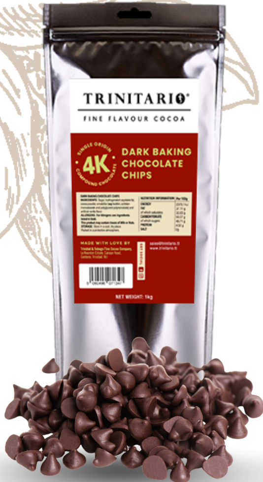
DARK BAKING CHOCOLATE CHIPS 4K (1KG)

WHOLESALE PRICE: $125.00 TTD RETAIL PRICE: $150.00 TTD