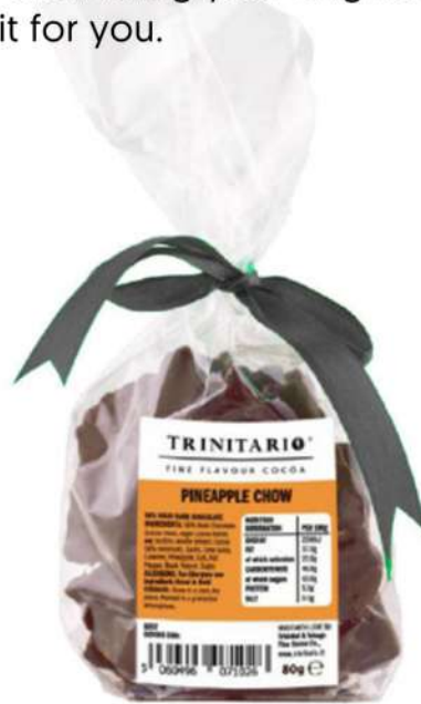
Pineapple Chow (80g)

RETAIL PRICE: $80.00 TTD *WHOLESALE PRICE: $68.00 TTD