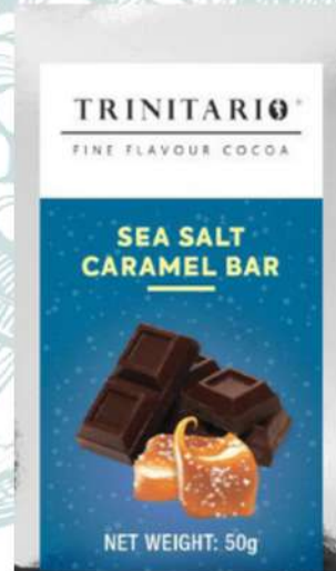
Sea Salt Caramel Bar

RETAIL PRICE: $48.00 TTD *WHOLESALE PRICE: $40.00 TTD