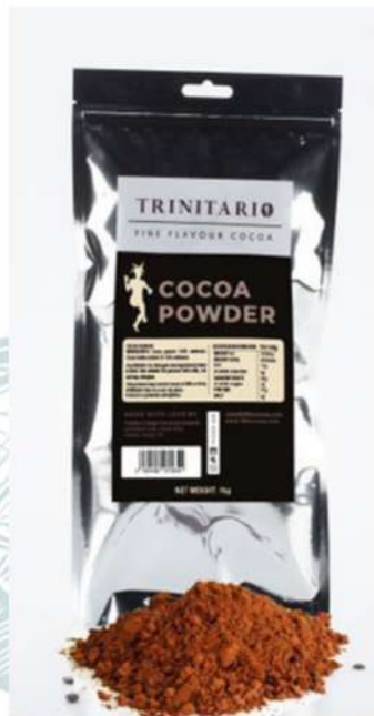
Cocoa powder 10kg