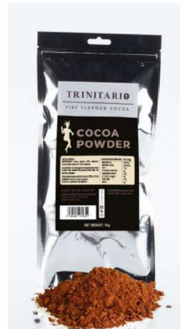
Cocoa powder 25kg