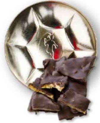
Pineapple Chow (80g)