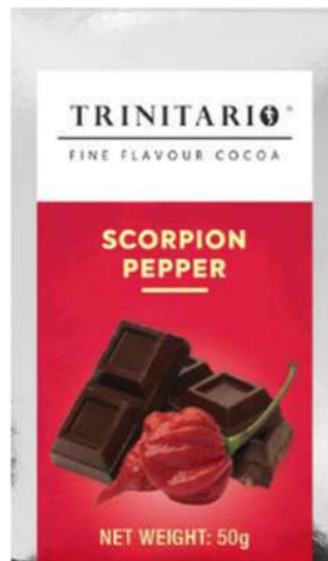
Scorpion Pepper Bar

RETAIL PRICE: $48.00 TTD *WHOLESALE PRICE: $40.00 TTD