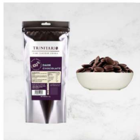
100% Dark Chocolate

RETAIL PRICE: $250.00 TTD *WHOLESALE PRICE: $220.00 TTD