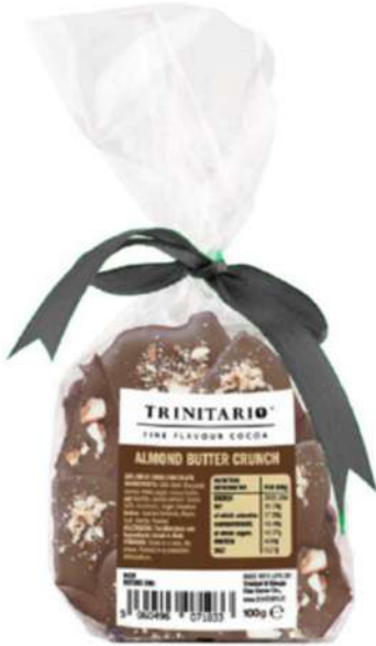
Almond Butter Crunch (100g)

Loved our steelpans but don't necessarily need another? Our refills are available for you to still get the Trinitario chocolates you love. Come in to pick up some, or even bring your original steelpan and we'll refill it for you.