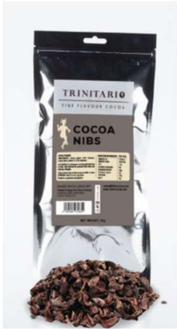
Cocoa Nibs 200g

RETAIL PRICE: $70.00 TTD *WHOLESALE PRICE: $60.00 TTD