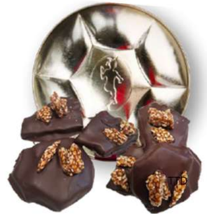
Bene Crunch (100g)