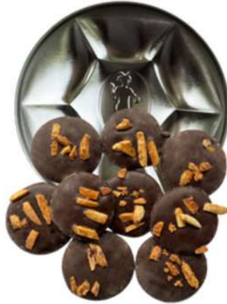
Orange and Almonds Medallions (100g)