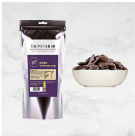
70% Dark Chocolate(1kg)

RETAIL PRICE: $230.00 TTD *WHOLESALE PRICE: $200.00 TTD