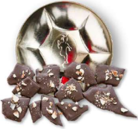
Almond Butter Crunch (100g)