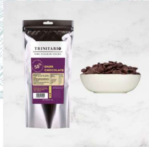
58% Dark Chocolate (1kg)

RETAIL PRICE: $230.00 TTD *WHOLESALE PRICE: $200.00 TTD