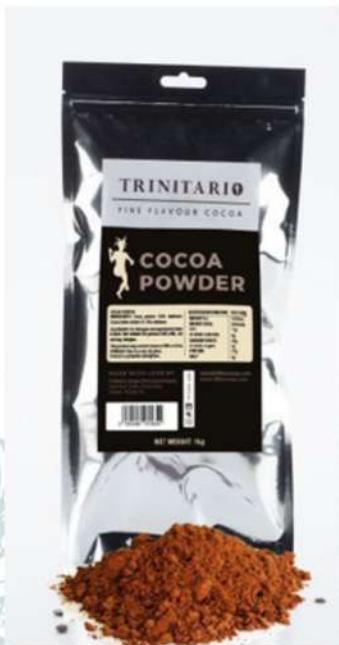
Cocoa powder 1kg

RETAIL PRICE: $75.00 TTD *WHOLESALE PRICE: $60.00 TTD