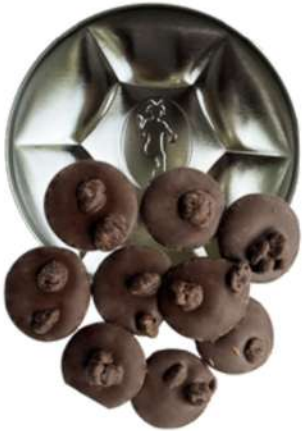
Orange, Rum and Raisin Medallions (100g)