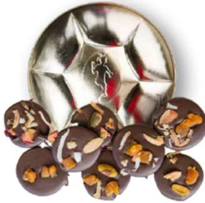
Apricot Medallions (88g)