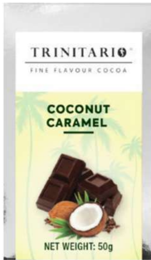
Coconut Caramel Bar

RETAIL PRICE: $48.00 TTD *WHOLESALE PRICE: $40.00 TTD