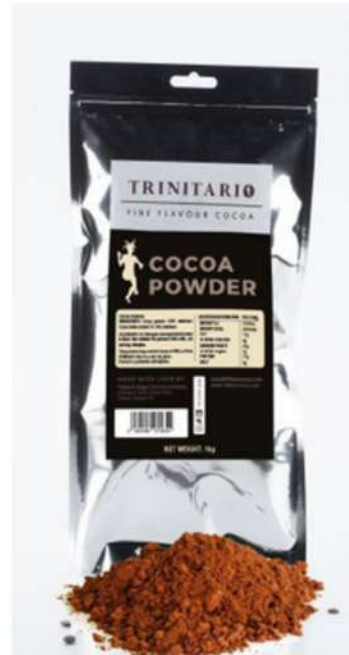
Cocoa Powder 200g

RETAIL PRICE: $70.00 TTD *WHOLESALE PRICE: $60.00 TTD